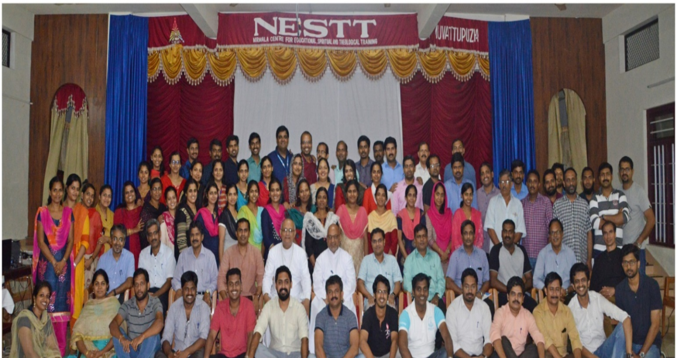
Pursuing excellence in Engineering Education 09-07-2018 to 11-07-2018