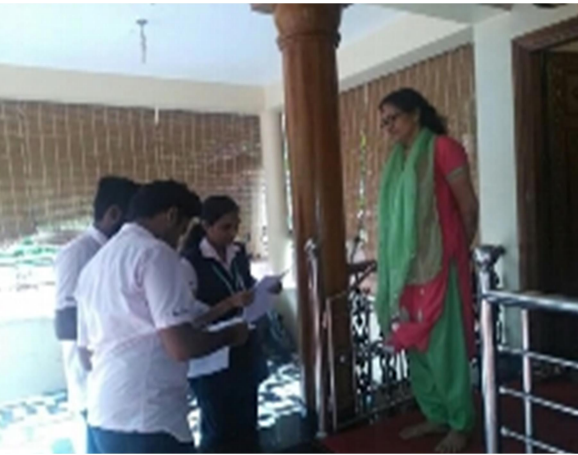
By 4:00 pm the students reported back to the college. The students were provided with refreshment and dispersed off.