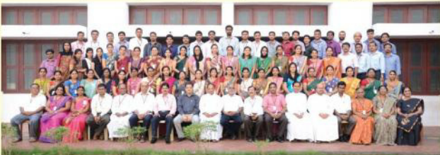
Participants of Two Day Workshop

1.1. A two day workshop on 'Intellectual Property Rights and Research Funding Possibilities' was jointly organized by PIC-Kerala/KSCSTE and Department of Electronics and Communication Engineering, Jyothi Engineering College on 16 th and 17 th of January for the teaching staff and Post Graduate students of Jyothi Engineering College Cheruthuruthy, Thrissur.