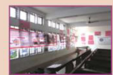
ROAD SAFETY AWARENESS