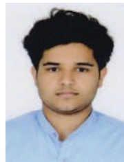
AJIN M G 8.81 SGPA