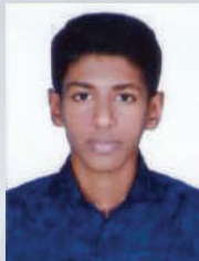
N BINURENJ 9.46 SGPA